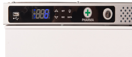
PRECISION digital XW737K controller with display, on-screen graph, audible and visual alarm.