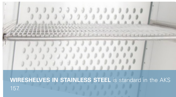
WIRESHELVES IN STAINLESS STEEL is standard in the AKS 157.