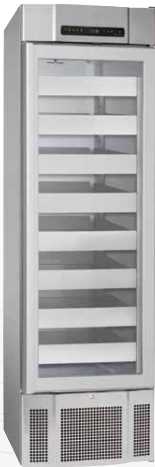
BioMidi 425. Drawers and glass door are optional extras.

The BioMidi 425 cabinet is designed to meet your biomaterial refrigeration and freezer requirements, with very few limitations.