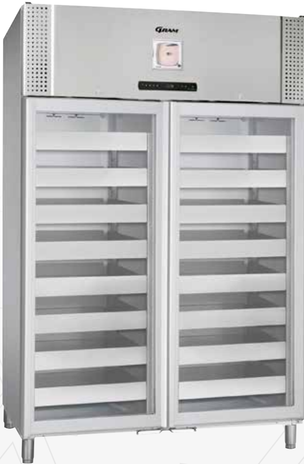
BioBlood BR1400. Drawers and chart recorder are optional extras.

The BioBlood 1270/1400 design is customised to meet the special requirements associated with the controlled storage of blood, plasma and blood-related products.