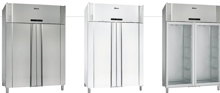
The BioPlus 1270/1400 is available as a refrigerator or freezer in either white or stainless steel finish. All BioPlus models come with selfclosing door. Glassdoor is available for refrigerator.

In terms of performance, these units are designed to provide the very best results even under exceptional conditions. The BioPlus utilises environmentally responsible HFC-free foam propellants and is available with CFC-free or HFC-free refrigerants.